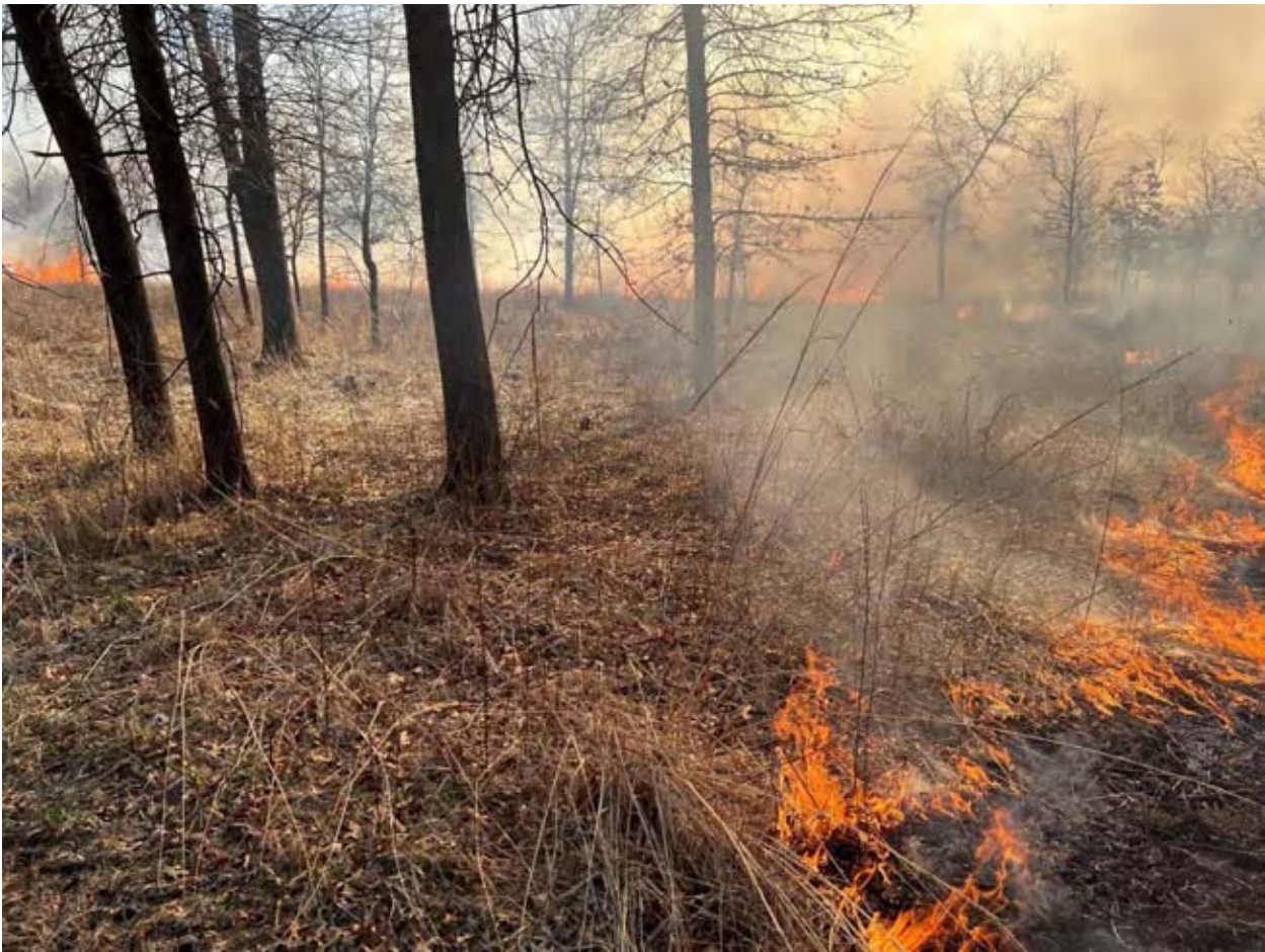
Fire in the woods of Big Jump Prairie.