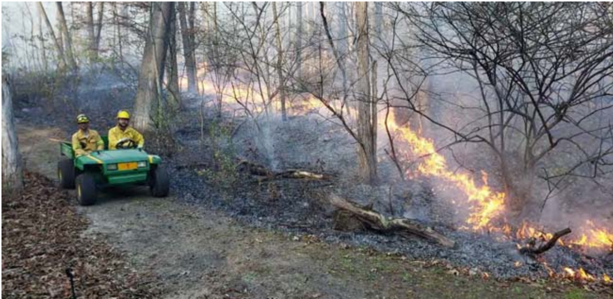
Austin Webb helped Stronghold Camp do fire in their nice oak woods.