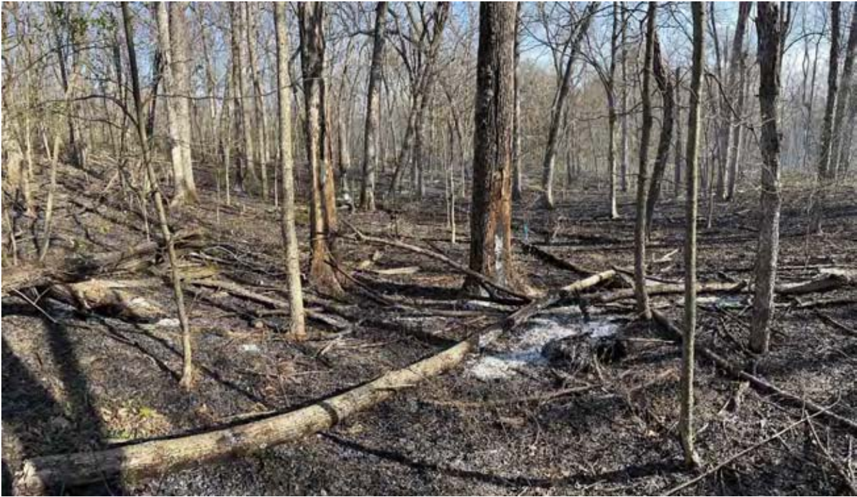
Lowden Miller State Forest a day after the fire. In a few weeks it was green again, but with less brush.