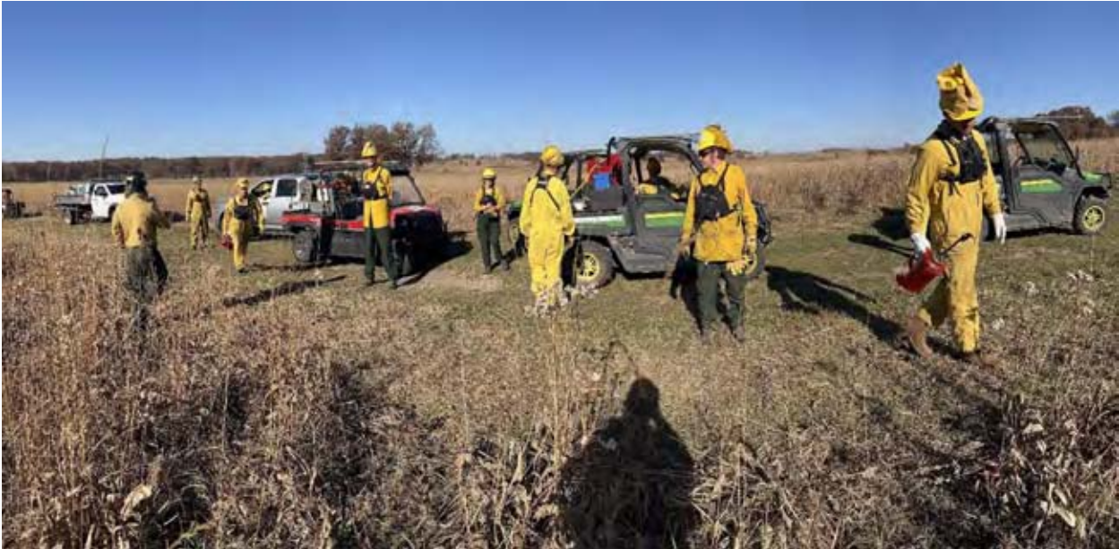
Getting ready to start a fire.