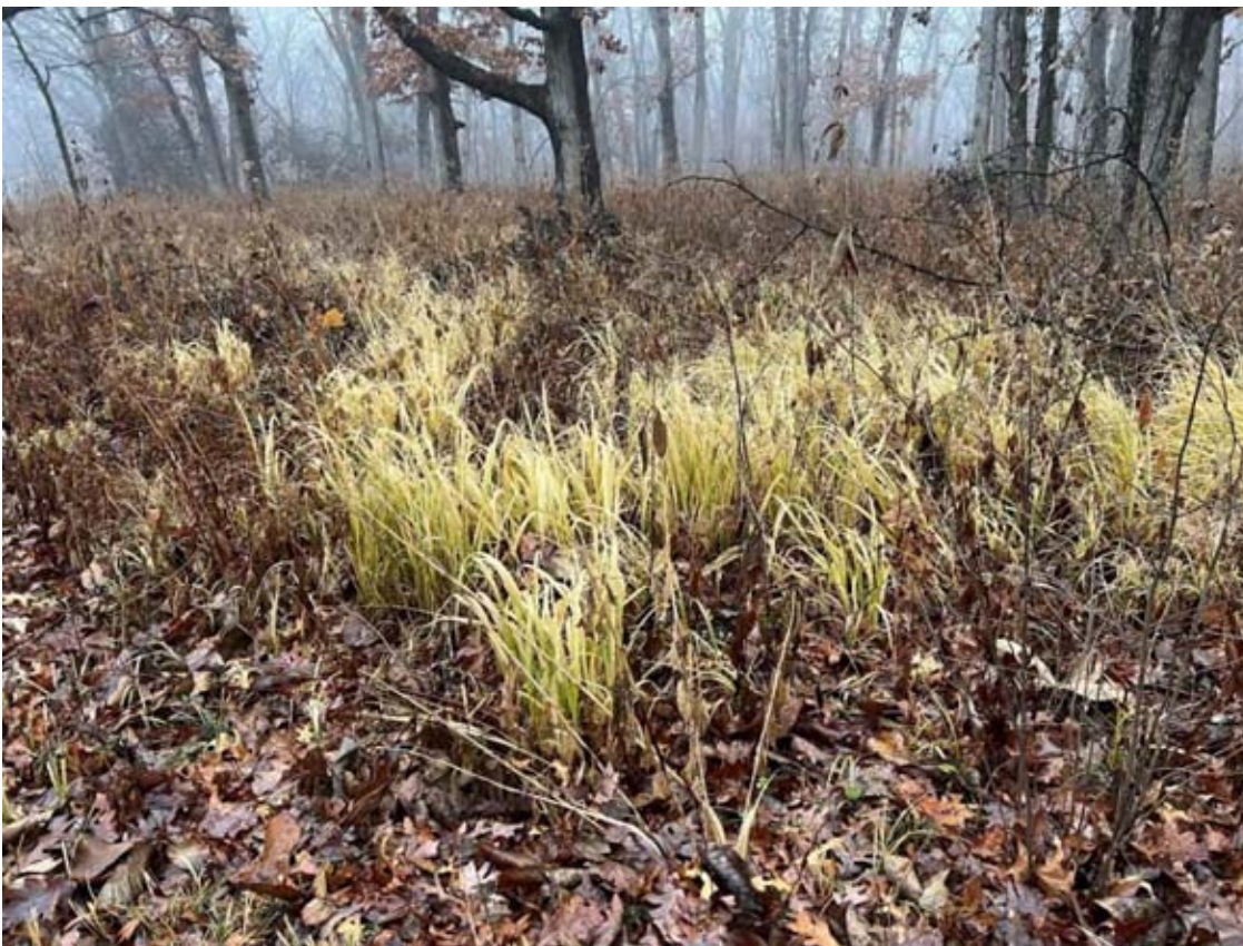
American beak grass has greatly increased in a woodland unit we have burned frequently for two decades. The brush layer is diminished, and the oak and hickory have space.