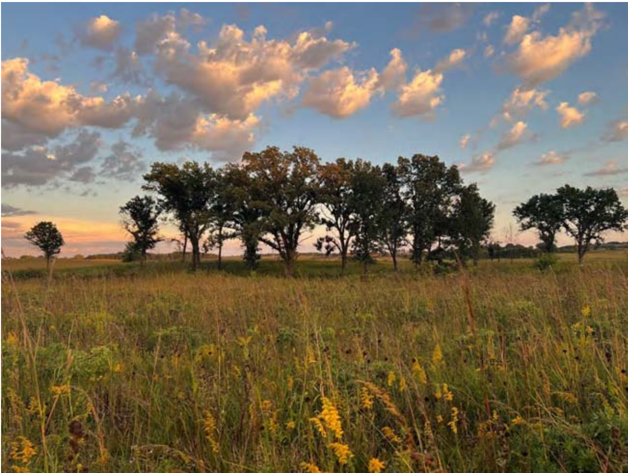
Eight oak savanna.