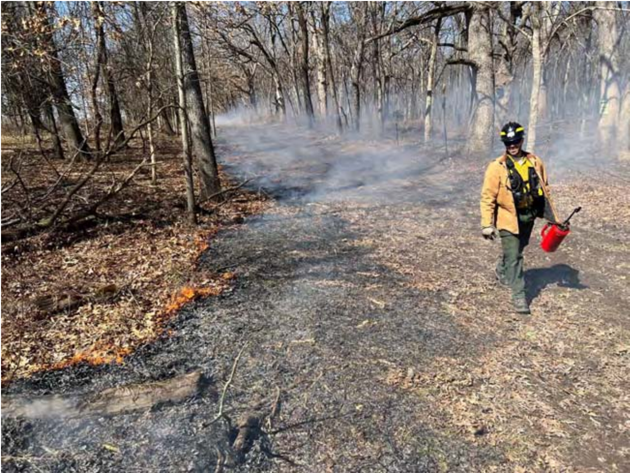
Cody Considine with leaf litter burning. Even these mild fires have good ecological effect.