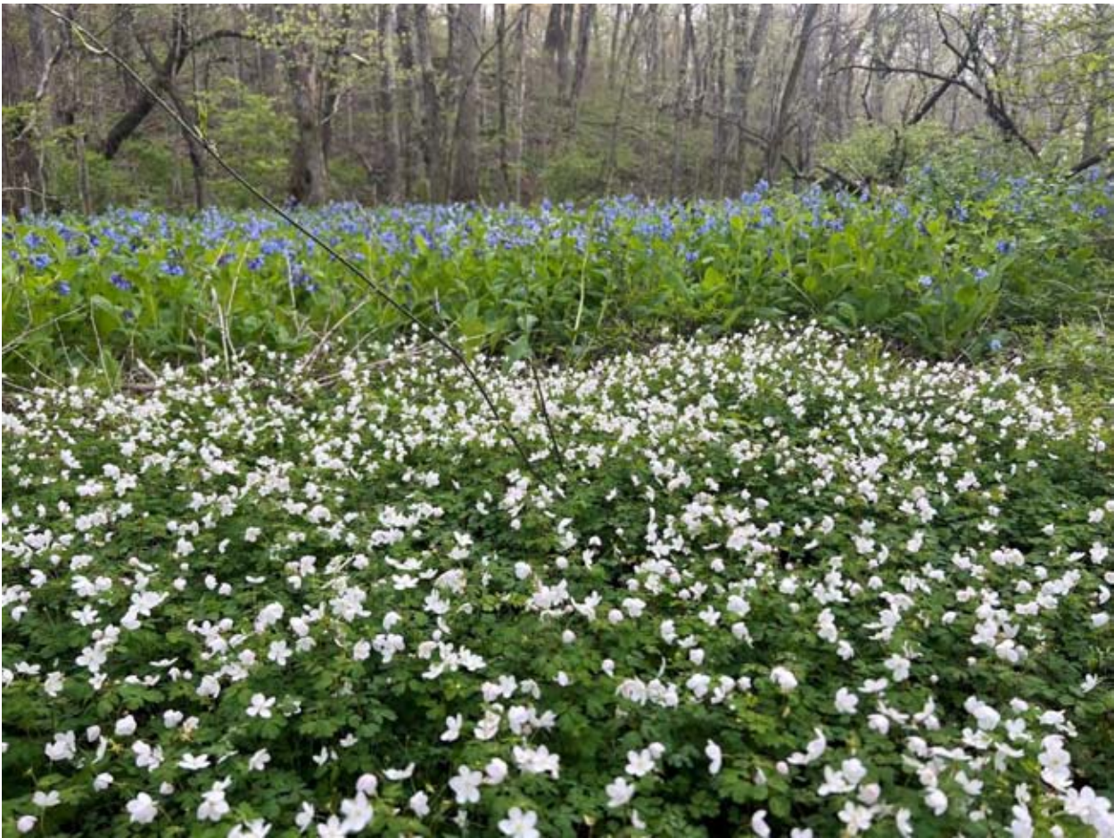
A few weeks after a fire, this bloomed bright with these ephemerals at Franklin Creek State Natural Area. On the slope behind you can see some brush was thinned.