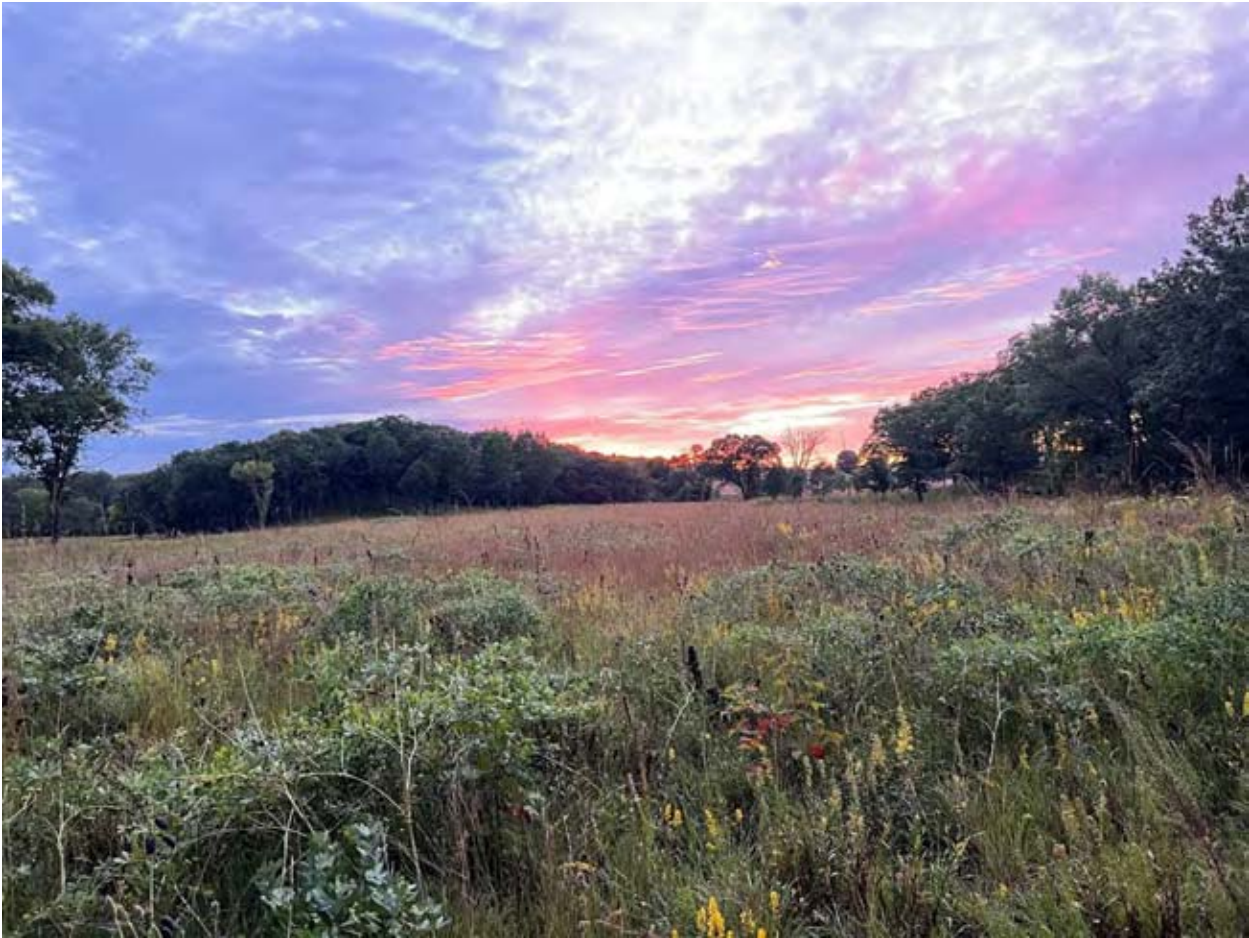
Stonebarn Savanna with its nice prairie planting at sunset.