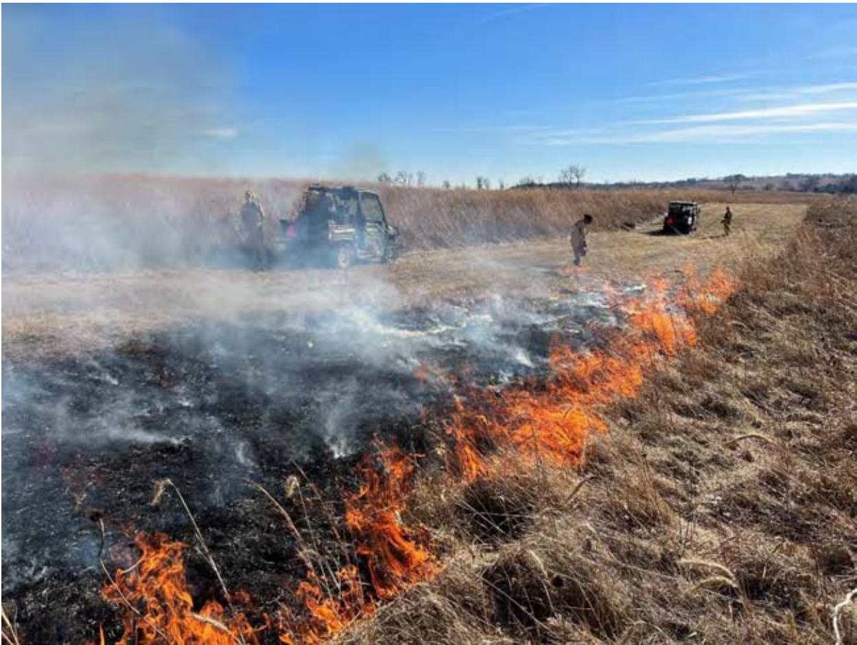
Good and wide fire breaks make for easier fire work.