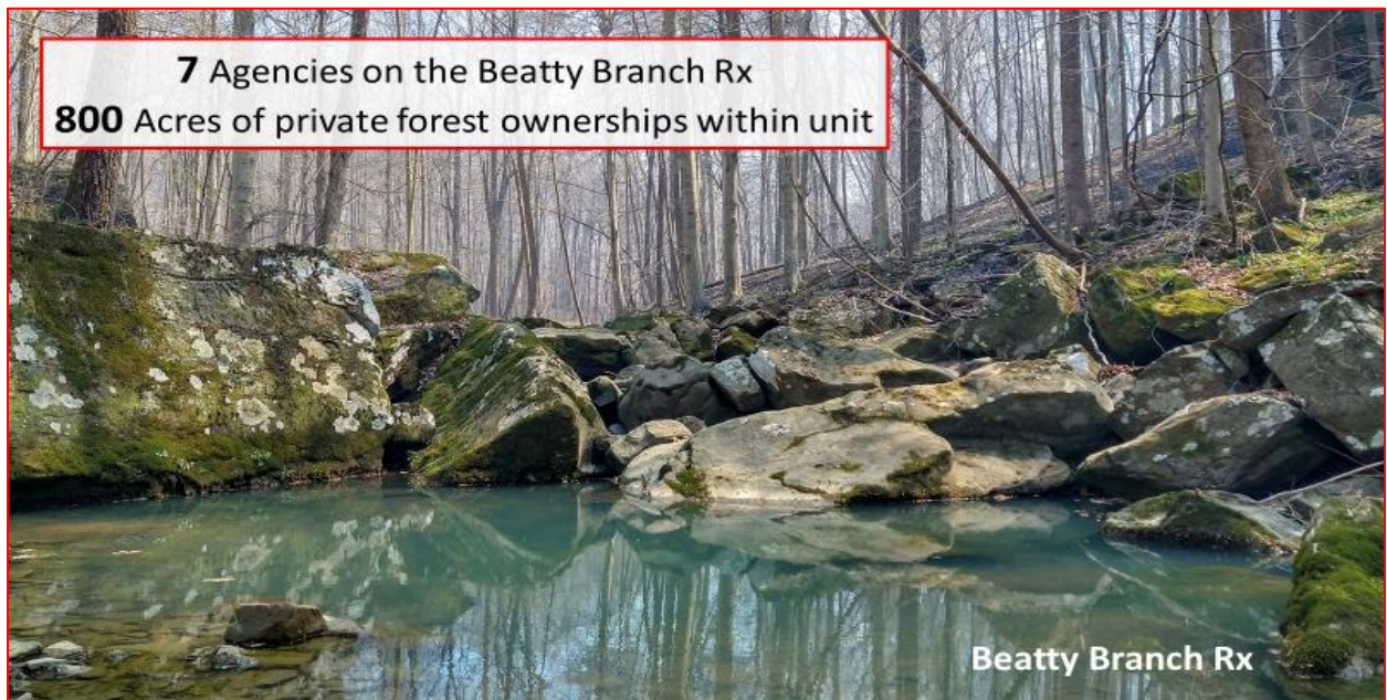
A post-fire view of a rocky drainage found within the Beatty Branch Rx in Pope County. This 950-acre unit includes 150 acres of national forest land, with multiple private ownerships comprising the remaining acres. The Forest Service, IDNR - Division of Forestry, SIPBA, Shawnee RC&D, Rural Pope County Fire Protection District, out-of-state Bureau of Land Management personnel and TNC all worked together to implement this burn.