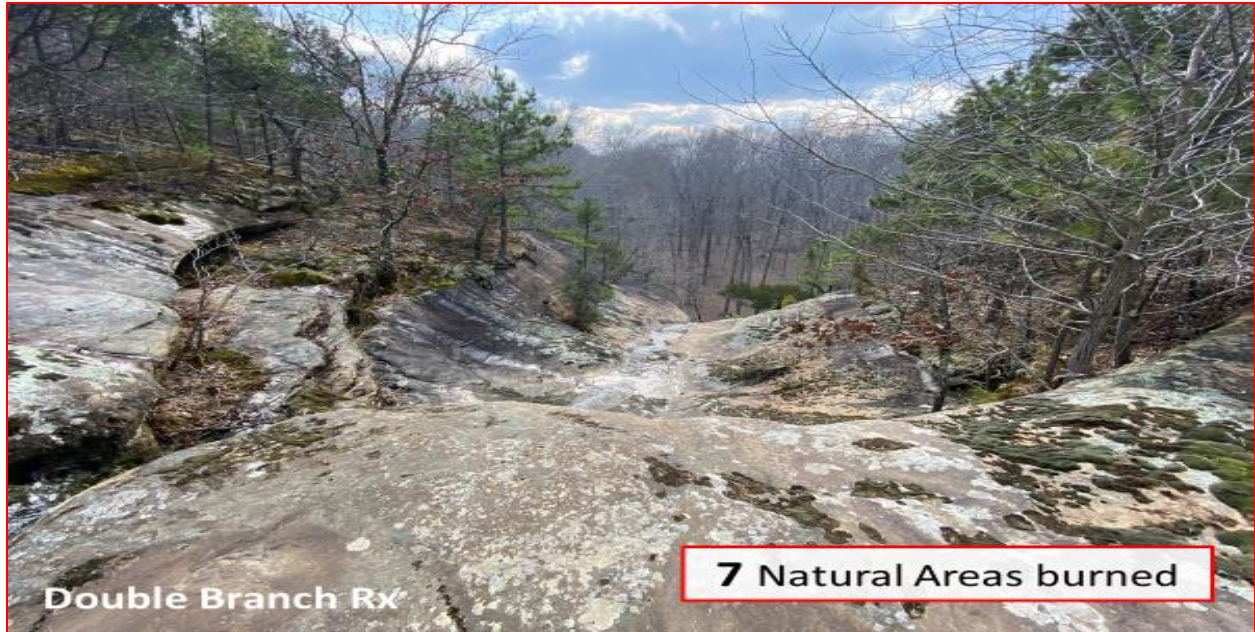
View from atop one of the waterfalls within the Jackson Hole Ecological Area, one of two natural areas in the Double Branch Rx.