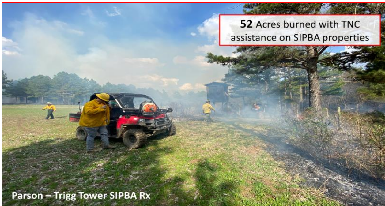
Protecting a hunting blind during a SIPBA private land prescribed burn near Trigg Tower.