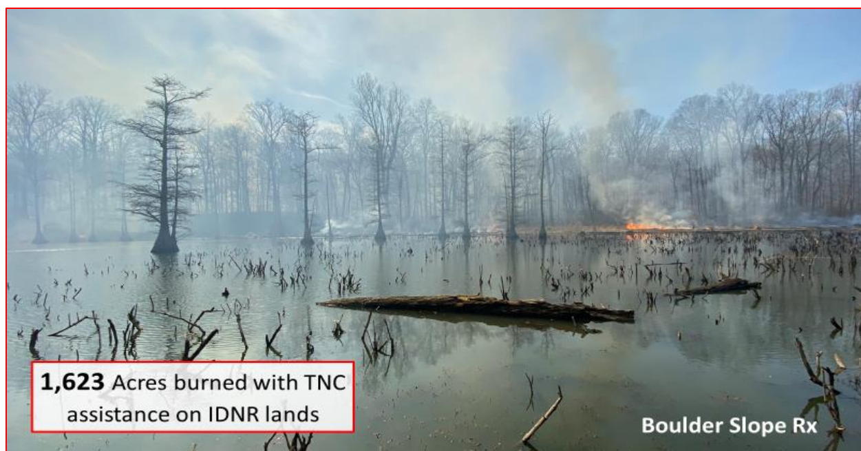
Fire wraps around a slough that was interior during the Boulder Slope prescribed burn at the Cache River State Natural Area.