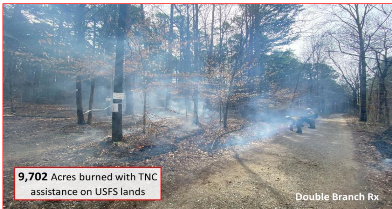
An interior action shot during the Double Branch Rx.