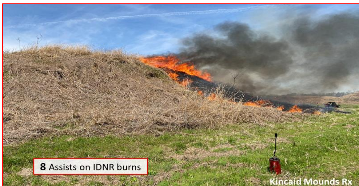
A backing fire makes its way around one of the Kincaid mounds. The crew dotted the mounds up wind and let the fire make its way around the mounds against the wind. This allowed any wildlife seeking refuge on the mounds, a chance to escape during the prescribed burn as opposed to ringing the units quickly.